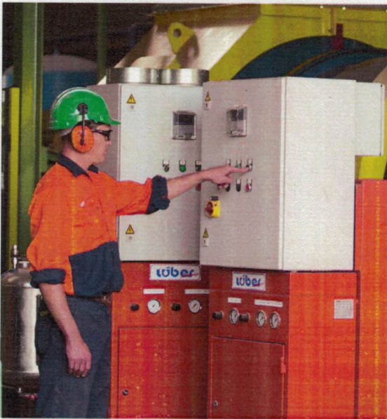
Switching off the Rotary Media Drum/Sand Reclaimer

For almost 80 years Keech Australia has been designing and manufacturing high integrity steel castings, domestically and internationally, for the mining, excavation, construction, agriculture, rail transport and defence industries.