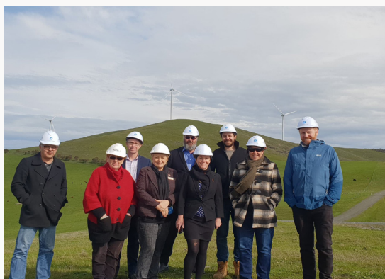
Photos: CVGA Board/Working Group visits solar and wind farms in the region