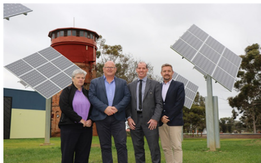
Photos: Hepburn partners celebrate Premiers Award; Gannawarra Shire staff