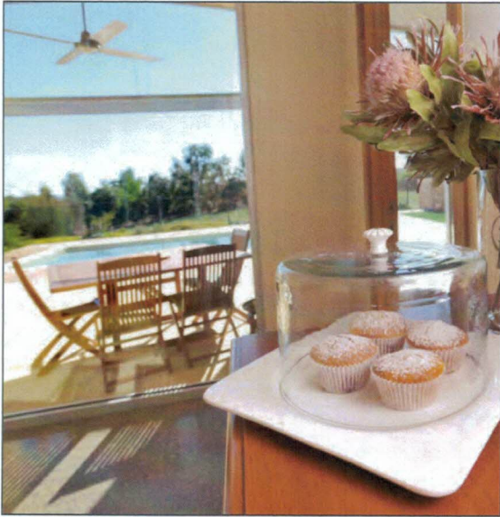
Afternoon tea at The Chocolate Lily Sustainable Stays B&B

The Chocolate Lily Sustainable Stays B&B in Sedgwick provides a warm, friendly and inviting sustainable accommodation experience for its guests.